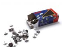
(SETPINS) PINS HEFTZWECKENSET